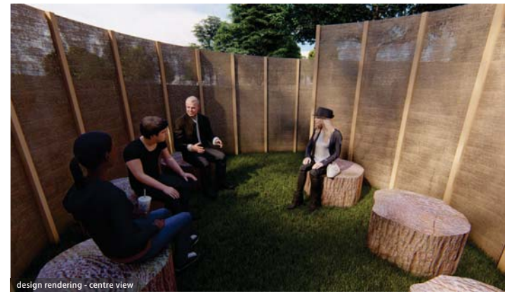
design rendering - centre view