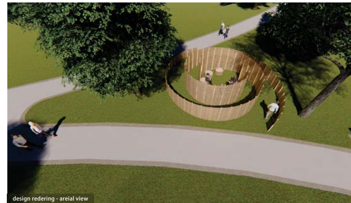
design rendering - aerial view