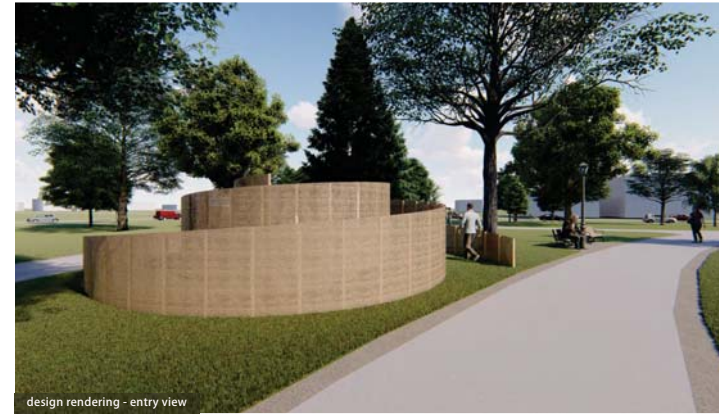
design rendering - entry view